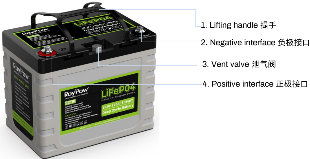
Figure 2. Schematic diagram of battery system